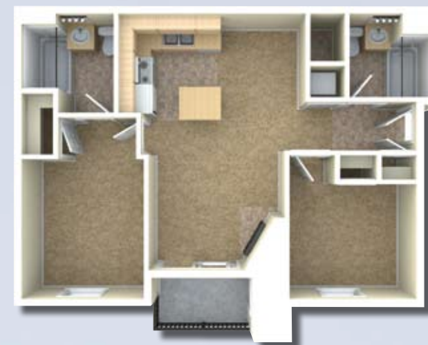
Flairons • 2 bed / 2 bath 1050 SF