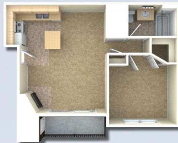
Ajax • 1 bed / 1 bath 803 SF