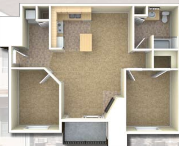
Telluride • 2 beds / 1 bath 990 SF