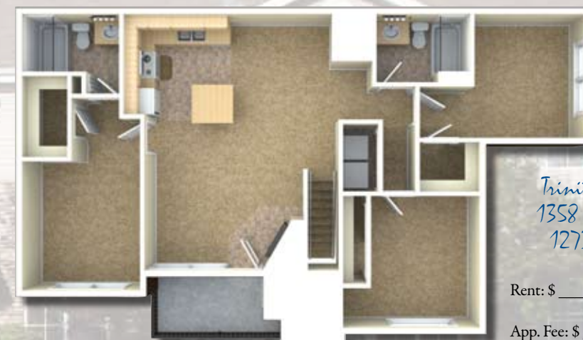
Trinity • 3 beds / 2 bath 1358 SF upper level home 1273 SF lower level home