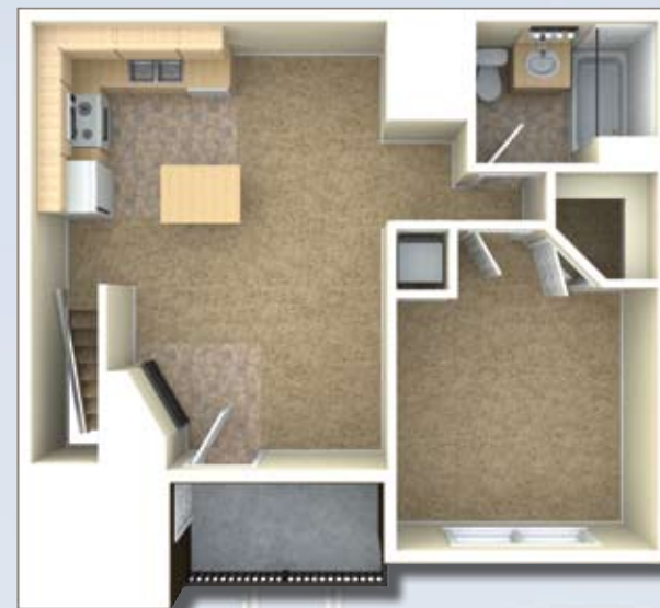
Sopris • 1 bed / 1 bath 899 SF upper level home 822 SF lower level home