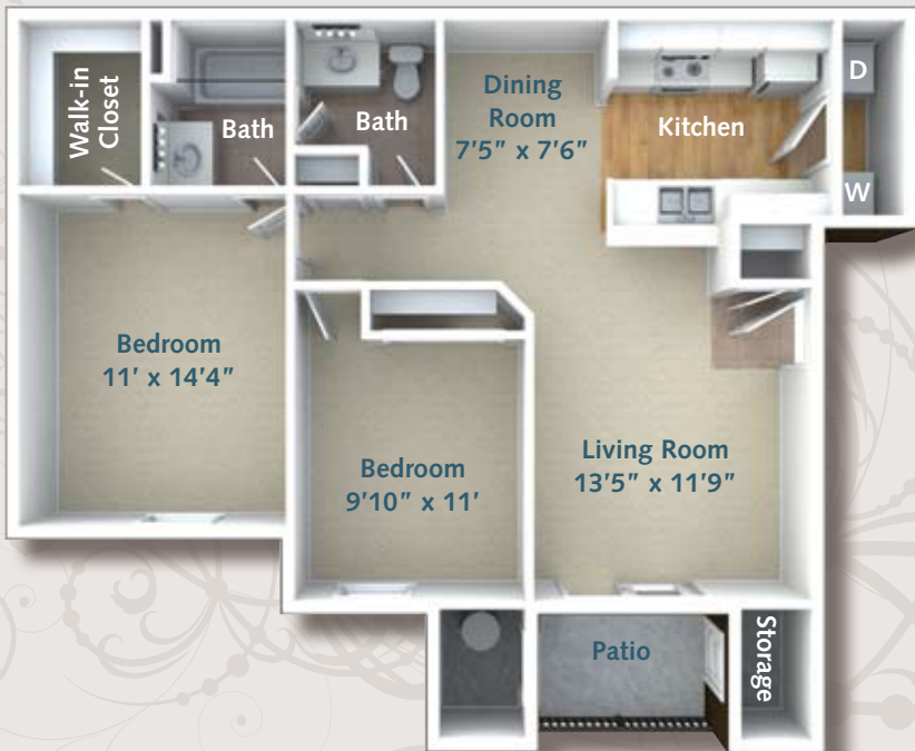
Two Bedroom, One and 1/4 Bath 978 square feet