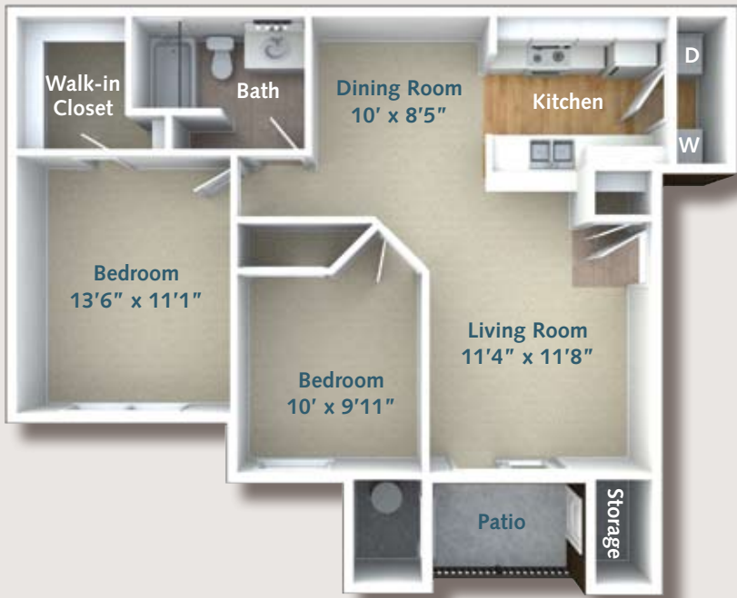
Two Bedroom, One Bath 956 square feet