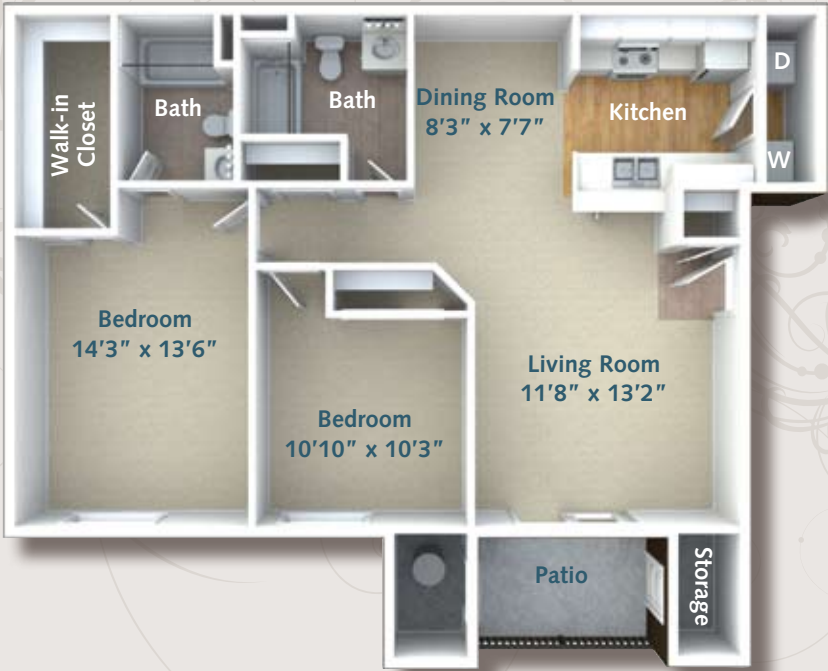
Two Bedroom, Two Bath 1059 square feet

Rent: $ _____ Deposit: $ _____ App. fee: $ _____ Other: $ _____