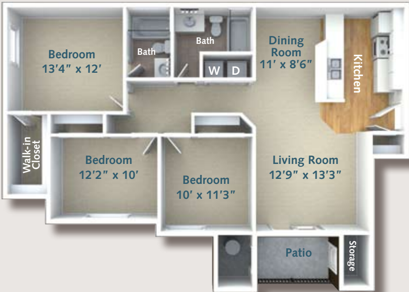
Three Bedroom, Two Bath 1248 square feet

Rent: $ _____ Deposit: $ _____ App. fee: $ _____ Other: $ _____